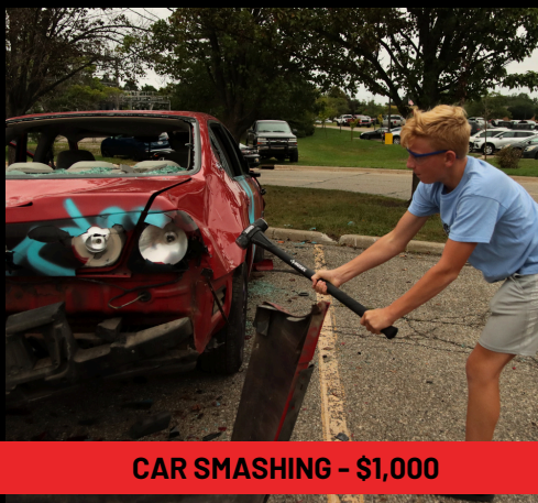
CAR SMASHING - $1,000