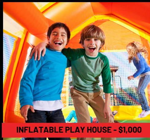
INFLATABLE PLAY HOUSE - $1,000