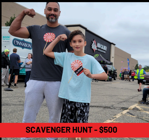
SCAVENGER HUNT - $500