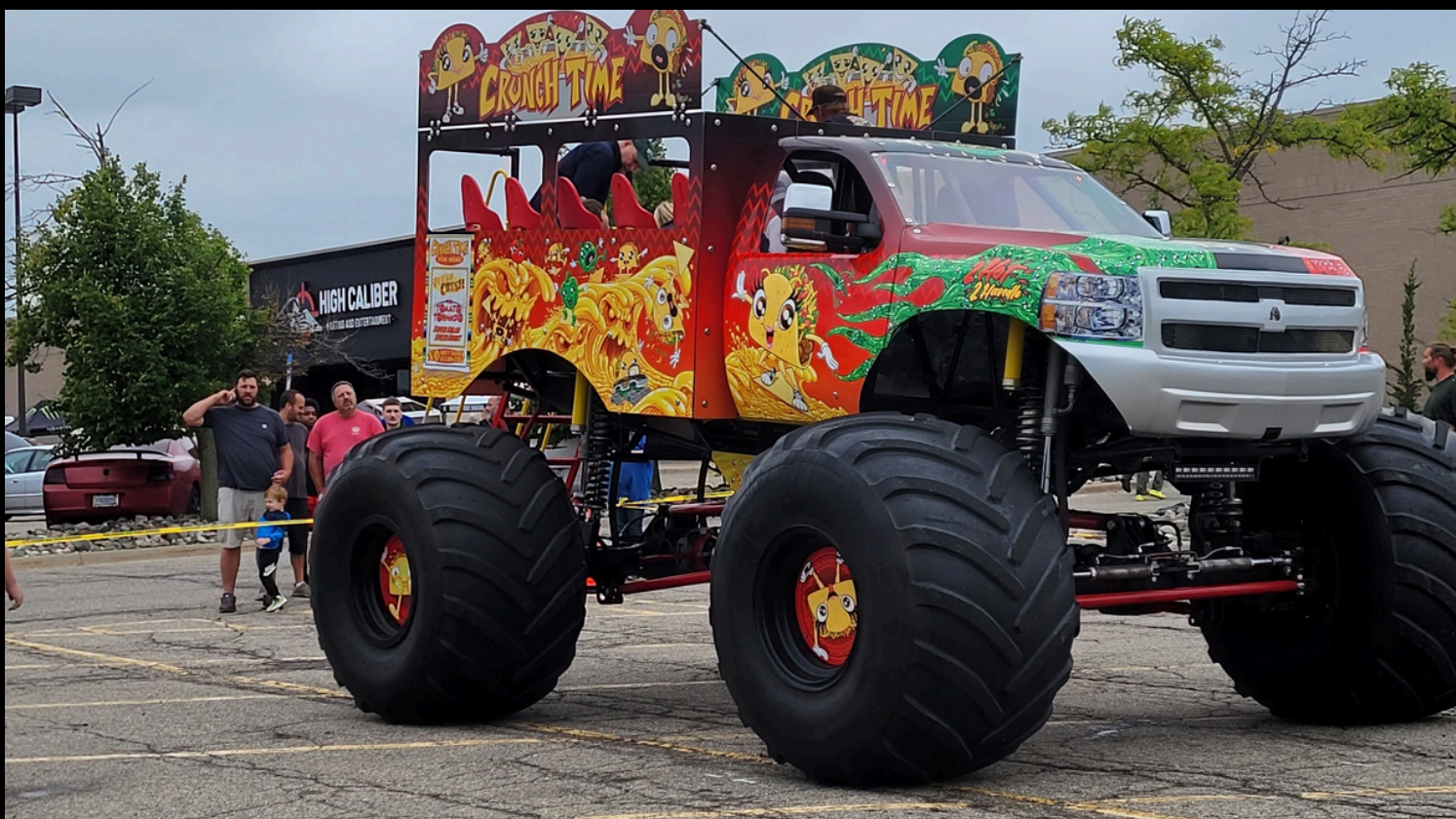
MONSTER TRUCK RIDES - $2,500